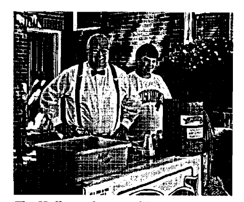
The Hulberts dispense libations at OTW