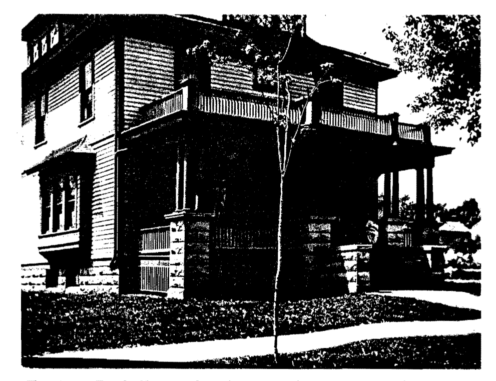
The Hauert Family Homestead on the corner of Walnut and Eighth circa 1915. (Now the site of the Chamber building.)

The Water Works Company has commenced work on the excavation of its reservoir upon the old Webb place. The large trees which covered the lot have been